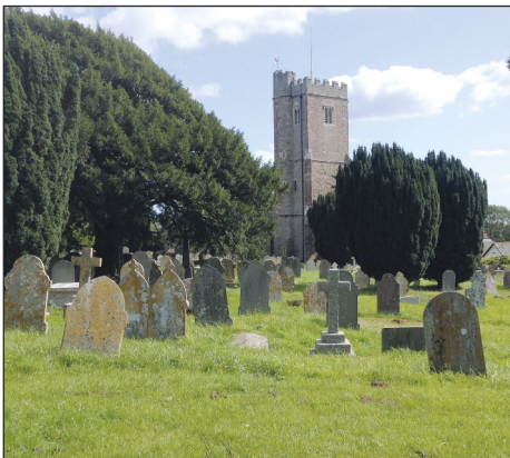
East Budleigh Church, winner of our Devon's Best Churchyard Competition 2019