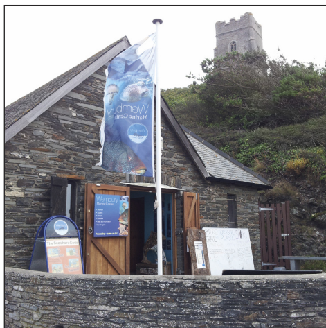
Wembury Marine Centre