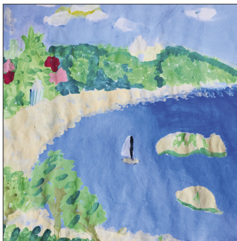
Painting Competition Winner 2019