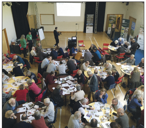
Town and Parish Councillors Planning Workshop held at Hatherleigh