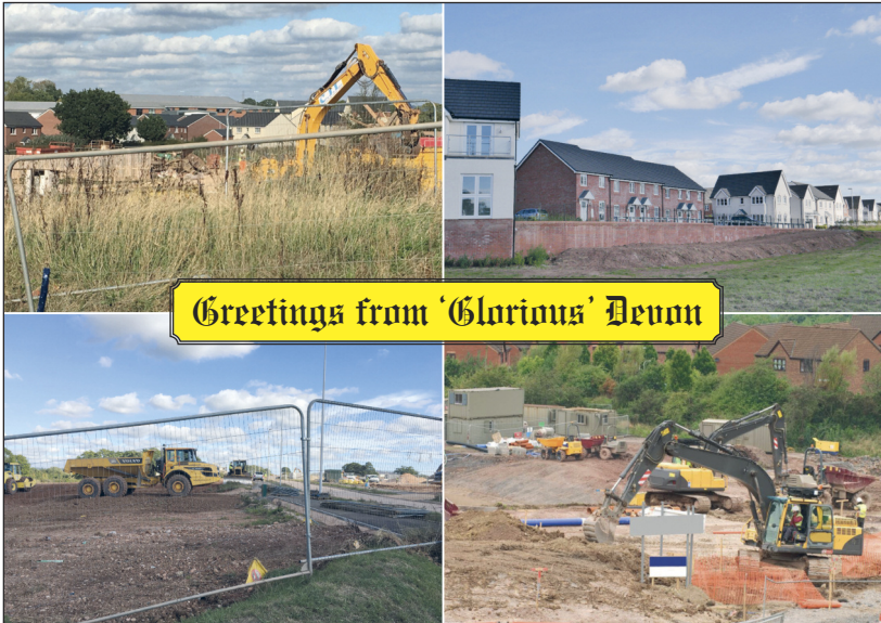
Our very successful 'Greetings from Glorious Devon' postcard campaign