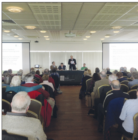
Sandy Park Seminar, Exeter